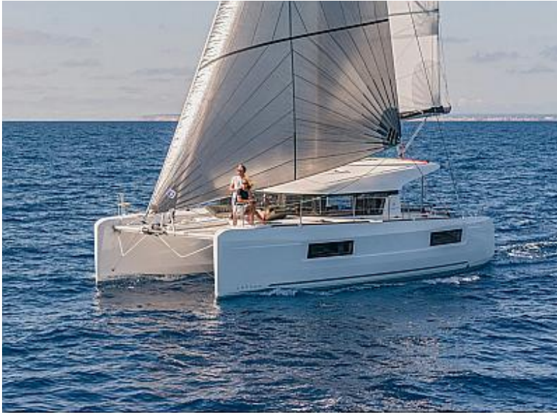
Lagoon 40 - France - 1992111 - Marlowe Jongschaap/Marlowe Yacht, Photo Access Online