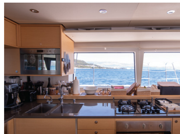
galley & saloon