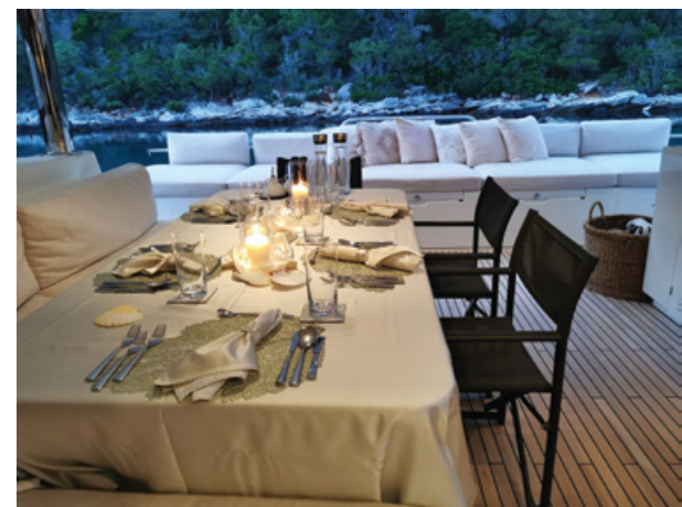
galley & saloon