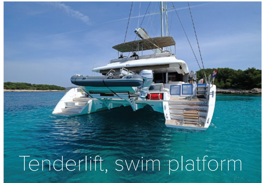
Tenderlift, swim platform