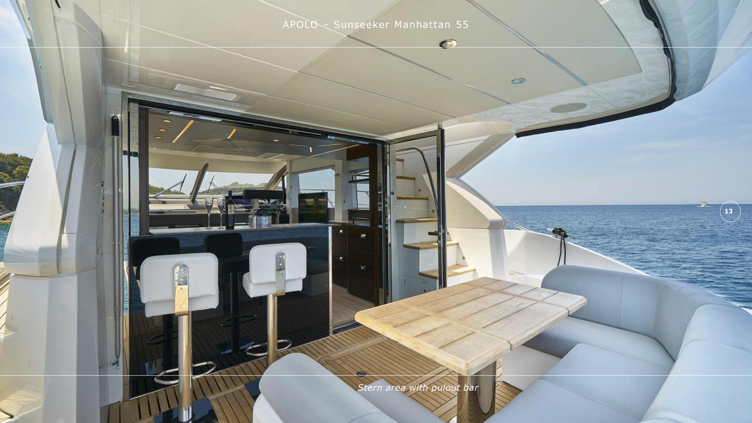
Stern area with pulout bar